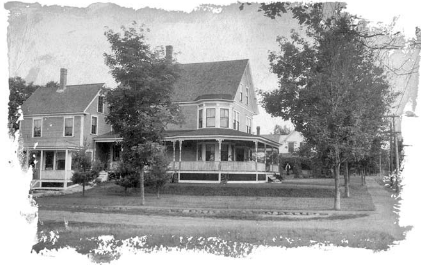
The Clement House 1908