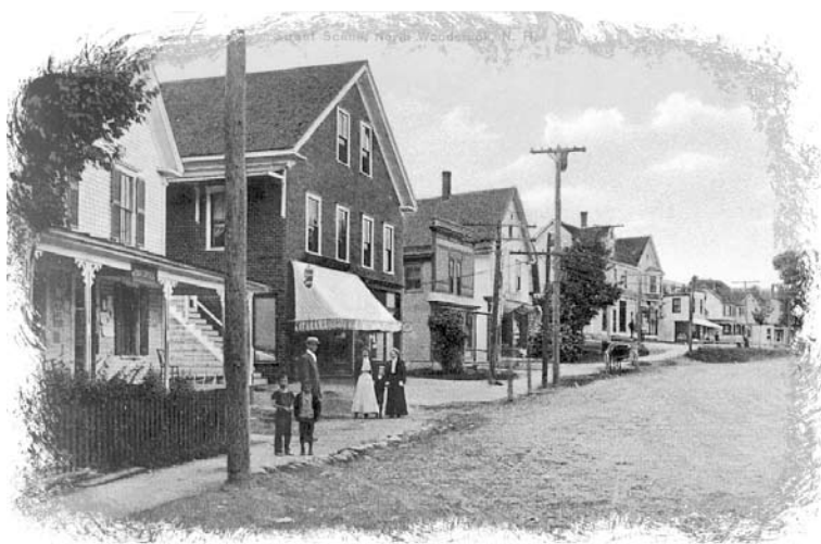
North Woodstock's Main Street, year unknown.