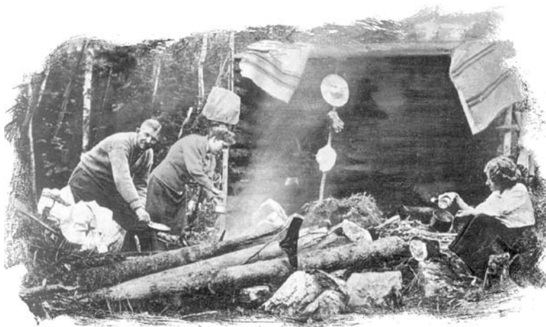
Camping in the White Mountains, early 1900's. Aren't you happy you chose breakfast at the Woodstock Inn?

Mocha Latte...$3.25 Raspberry Latte...$3.49