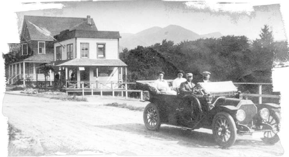
Car travelers on Main Street, North Woodstock circa 1900.

The buildings in the background are Hallsworth's Photograph Studio and home, which are now a flower and gift shop and Woodstock Inn Riverside.